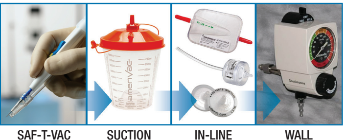
SAF-T-VAC SUCTION Electrocauteral Scalpel Sold Separately